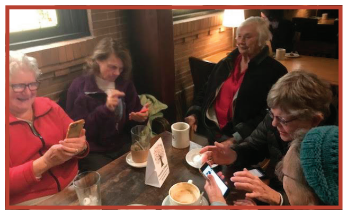
Eastside Village members becoming more tech-savvy.